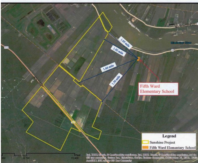
Distance to Fifth Ward Elementary School

Though Formosa's petrochemical complex was approved by the St. James Parish Council, the company must obtain multiple air, water, and land permits to proceed. The Louisiana Department of Environmental Quality (LDEQ) is currently reviewing the proposed air permits and the