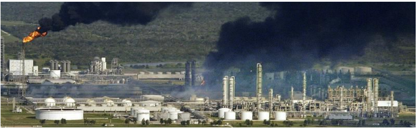
Victoria Advocate: Explosion at Formosa Plastics in Texas, 2005. According to CSB, 16 workers were injured.